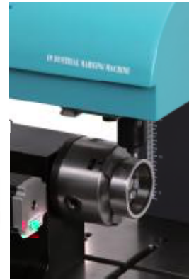
JZ115D Circular Electric Marking Machine